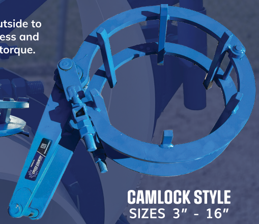
CAMLOCK STYLE SIZES 3" - 16"