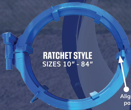
RATCHET STYLE SIZES 10" - 84"

industry alternatives. CCCSR Line Up Clamps not only streamline welding but also boost efficiency, reducing setup time—especially valuable in high-volume welding scenarios. (Patent Pending: 63/484,138)