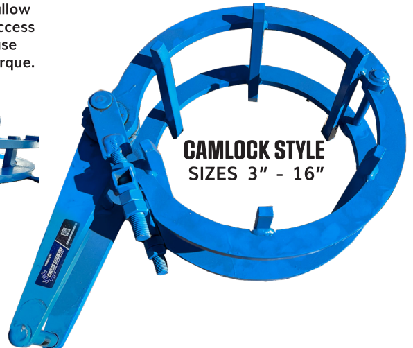
CAMLOCK STYLE SIZES 3" - 16"

Jack screws on the outside, to allow more weld access and increase tightening torque.