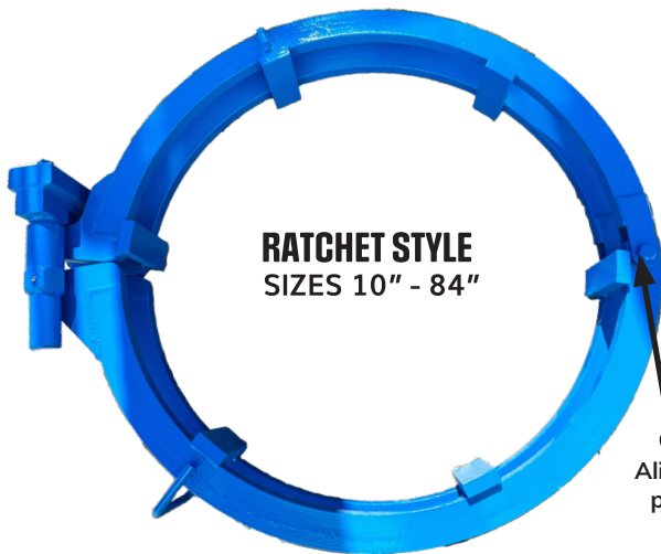
RATCHET STYLE SIZES 10" - 84"